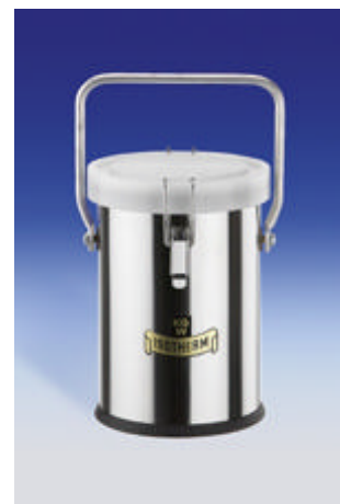
Dewar flask 26 B-E