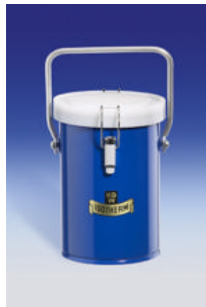
Dewar flask 26 B