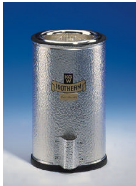
Dewar flask FB 9 CAL