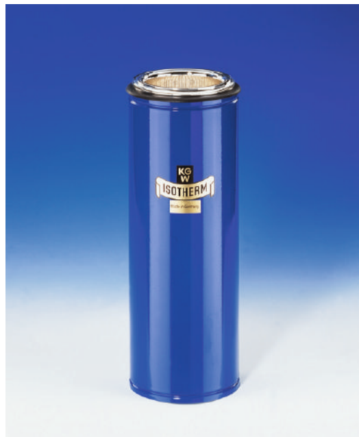
Dewar flask 9 C