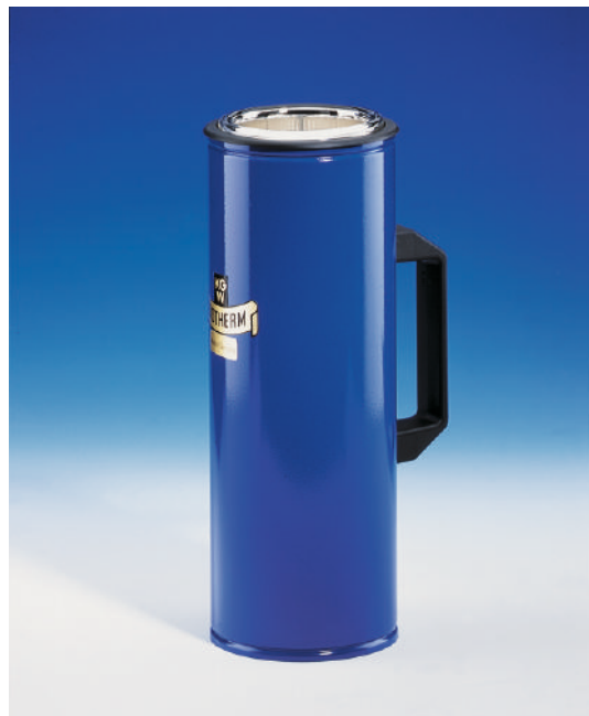
Dewar flask G 9 C